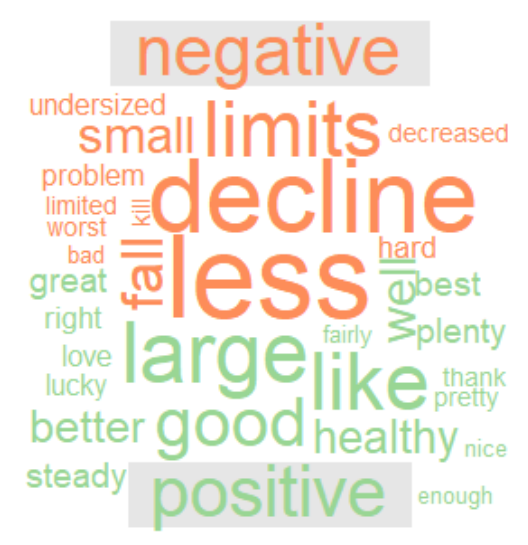
Figure 3: Most frequent words contributing to comment sentiment identified by automated sentiment analysis.