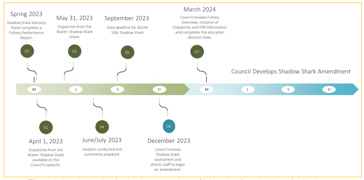
Figure 1 : Sample timeline for development and use of Dispatches from the Water for Shadow Shark.