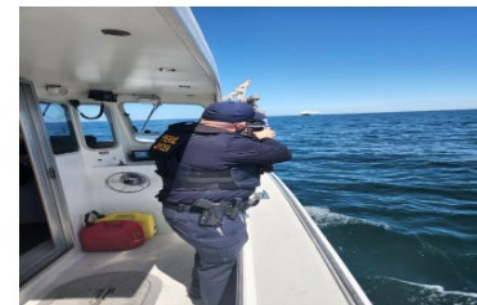
NOAA Enforcement Officer monitoring the vessel speed of a cargo ship.

Feature Story | New England/Mid-Atlantic, Southeast