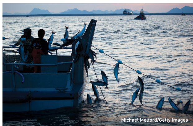
Salmon fishing in Alaska (top). Male sea lions in Newport, Oregon, at the Historic Newport Docks (bottom left). Driftnet fishing for sockeye salmon along the Nushagak River, Alaska (bottom right).