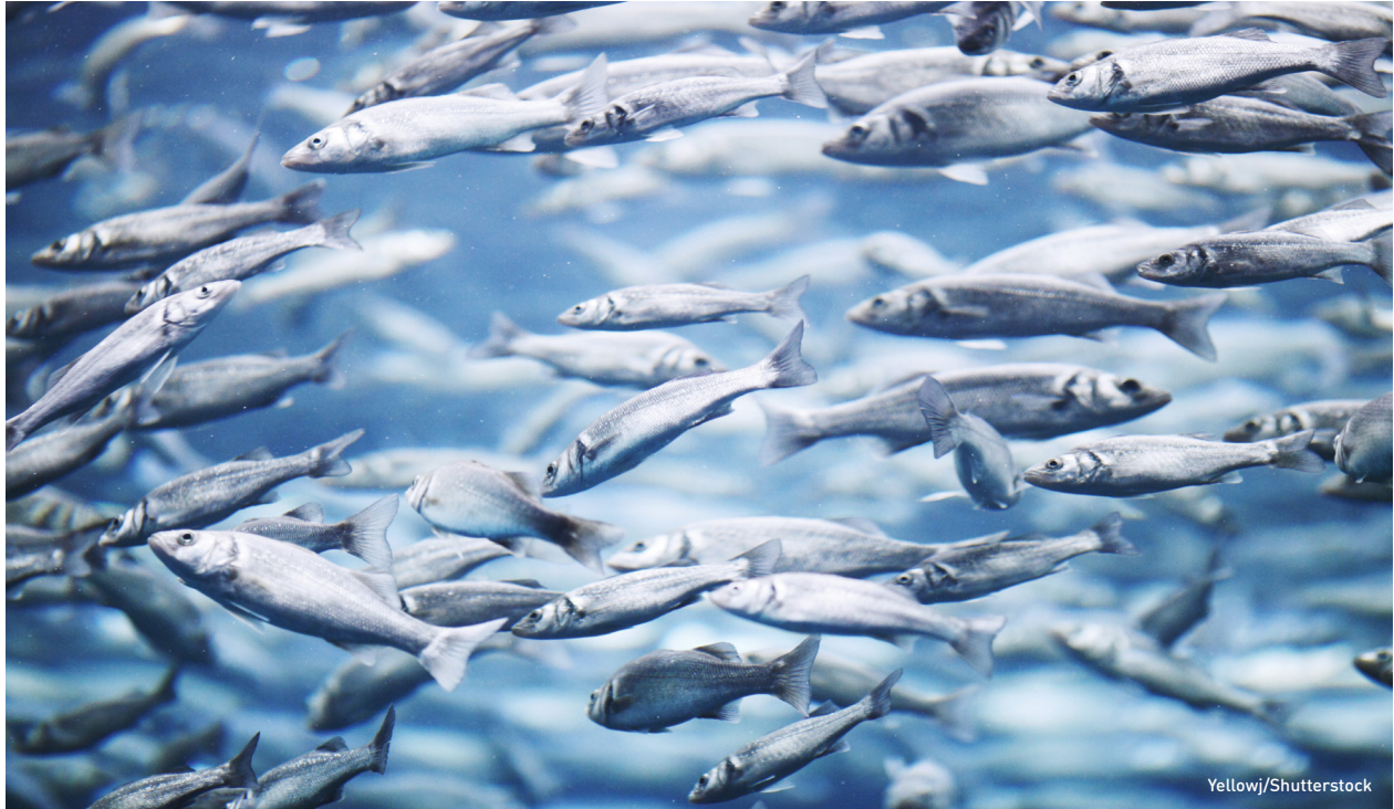
A school of mackerel.

The full report and a companion Implementation Volume providing extensive guidance on developing FEPs are available at www.LenfestOcean.org/EBFM .