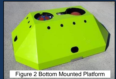
Figure 2 Bottom Mounted Platform