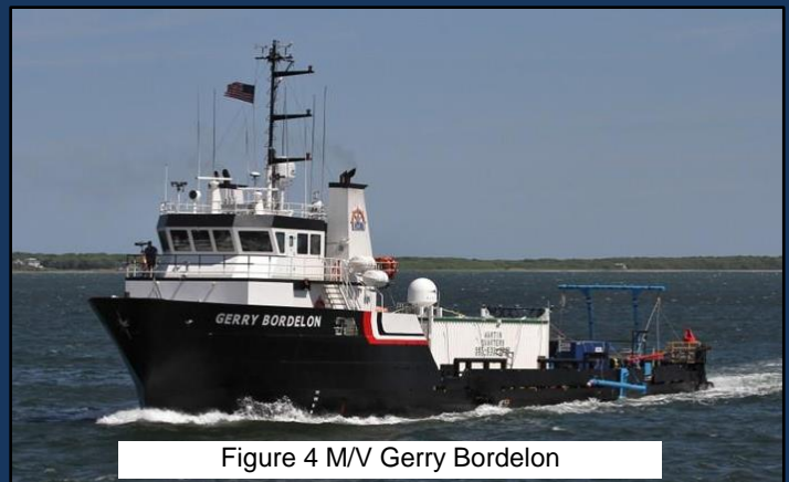
Figure 4 M/V Gerry Bordelon

The 170' survey vessel M/V Gerry Bordelon will continue conducting high resolution bathymetric and geophysical surveys of the Kitty Hawk offshore wind lease area and cable corridor through 2020. The vessel may be towing survey equipment up to 1,000' astern and a 0.5 NM clearance is requested. Commercial fishermen planning to deploy tended drop-nets, drop-pots, and mobile gear in the wind lease area should contact Rick Robins, Fisheries Liaison, at 757.876.3778 to coordinate. Commercial fishing vessels can call the survey vessel directly to communicate while in the survey area on a bridge-to-bridge basis on VHF 16 & 13.