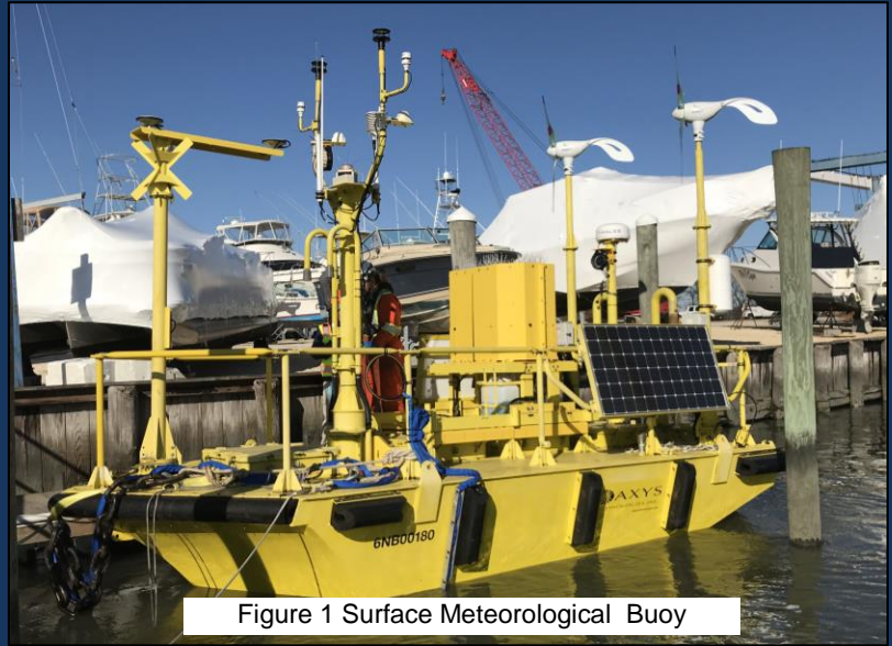
Figure 1 Surface Meteorological Buoy

Fishermen and mariners should note the location of the buoy, and are encouraged to enter the buoy latitude and longitude coordinates in chartplotters, as follows: