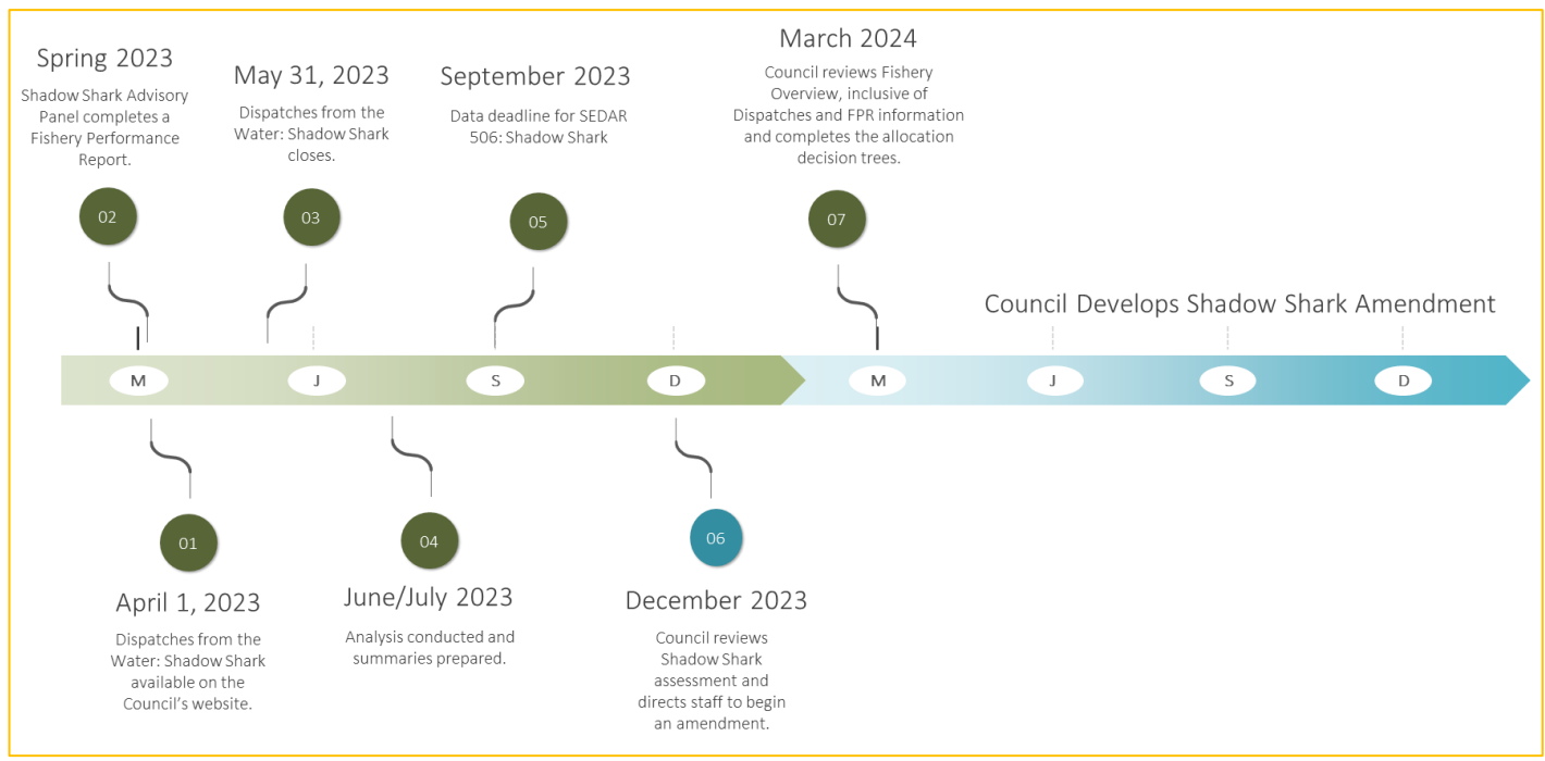
Figure 1 : Sample timeline for development and use of Saltwater Conversations for Shadow Shark.