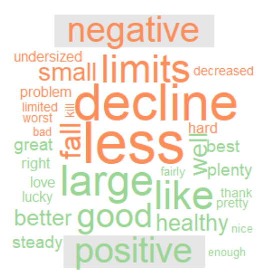
Figure 3: Most frequent words contributing to comment sentiment identified by automated sentiment analysis.