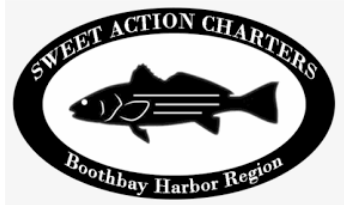
Sweet Action Charters