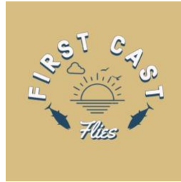
First Cast Flies