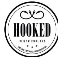
Hooked in New England