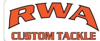
RWA Custom Tackle