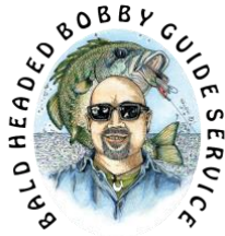
Baldhead Bobby Guide Service