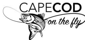
Cape Cod on the Fly