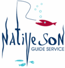
Native Son Guide Service