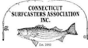
Connecticut Surfcasters Association