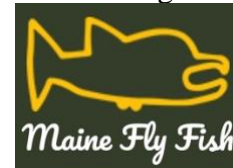
Maine Fly Fish