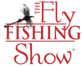
The Fly Fishing Show