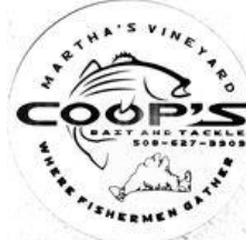
Coop's Bait and Tackle