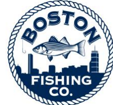
Boston Fishing Company