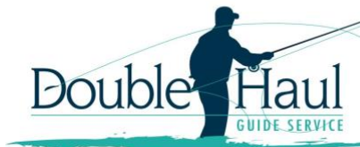
Double Haul Guide Service