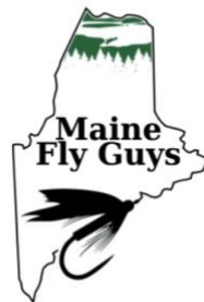
Maine Fly Guys