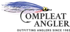
The Compleat Angler