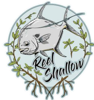
Reel Shallow Charters