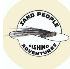
Sand People Fishing Adventures