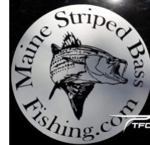
Maine Striped Bass Fishing