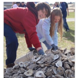
Volunteers Fill Shell Bags, Jockey's Ridge, NC