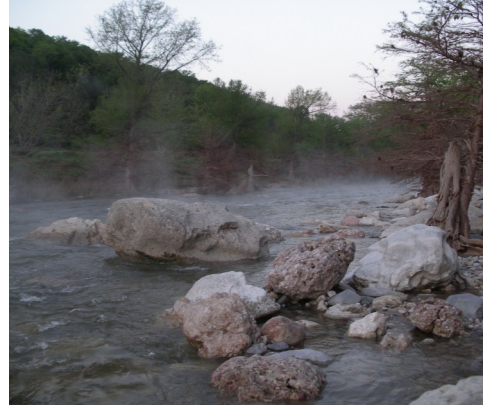
Guadalupe River Bass Habitat, Texas