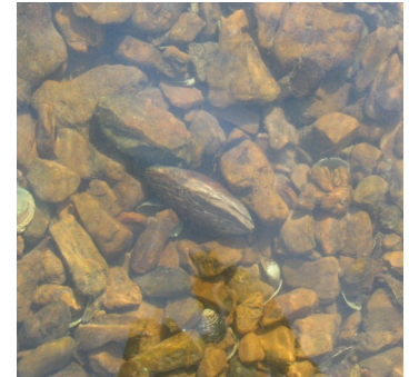
Duck River Mussels, TN