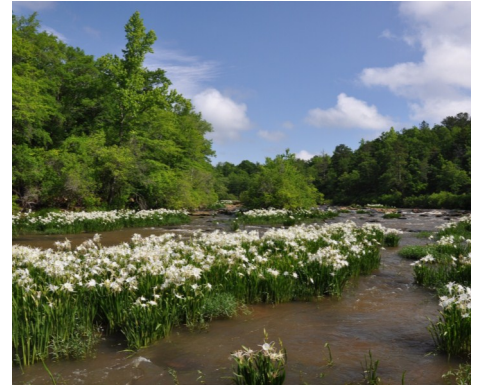
Spider Lilies in Flat Shoals Creek, Georgia

contributions of its partners, has achieved several notable successes in 2010. We are pleased to share some of the highlights of SARP's work: