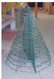
CPCT (lights will be removed)