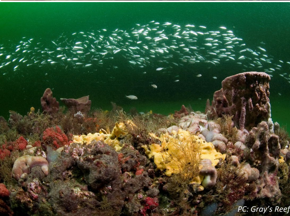
PC: Gray's Reef