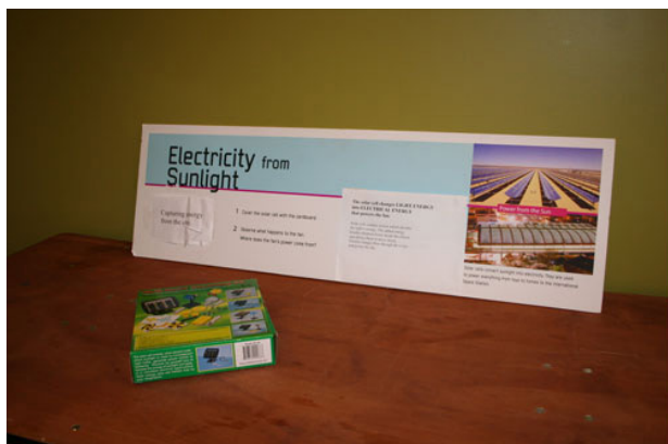
Science Storms “Sunlight from Energy” $20 solar cell kit & final exhibit component.