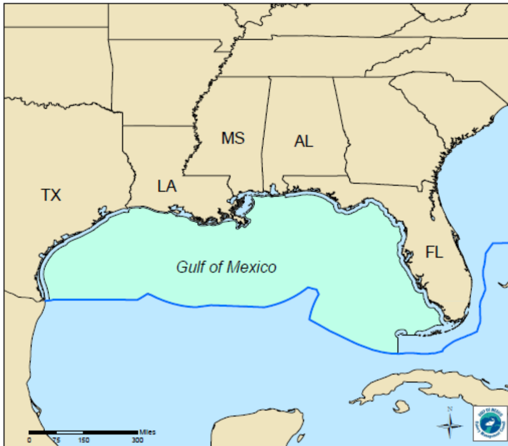
Figure 1.1.1. Jurisdictional boundary of the Gulf of Mexico Fishery Management Council.

Statement. Any events that change the fundamental nature of this proposed action will require a reevaluation of the categorical exclusion to determine its continued validity.