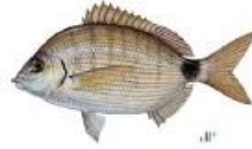
Figure 108: spottail pinfish ( Diplodus holbrookii ).