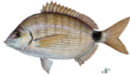
Figure 91: Spottail pinfish, Diplodus holbrookii .