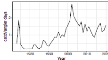
Figure 92: Nominal index (catch/angler days) from headboat logbooks.