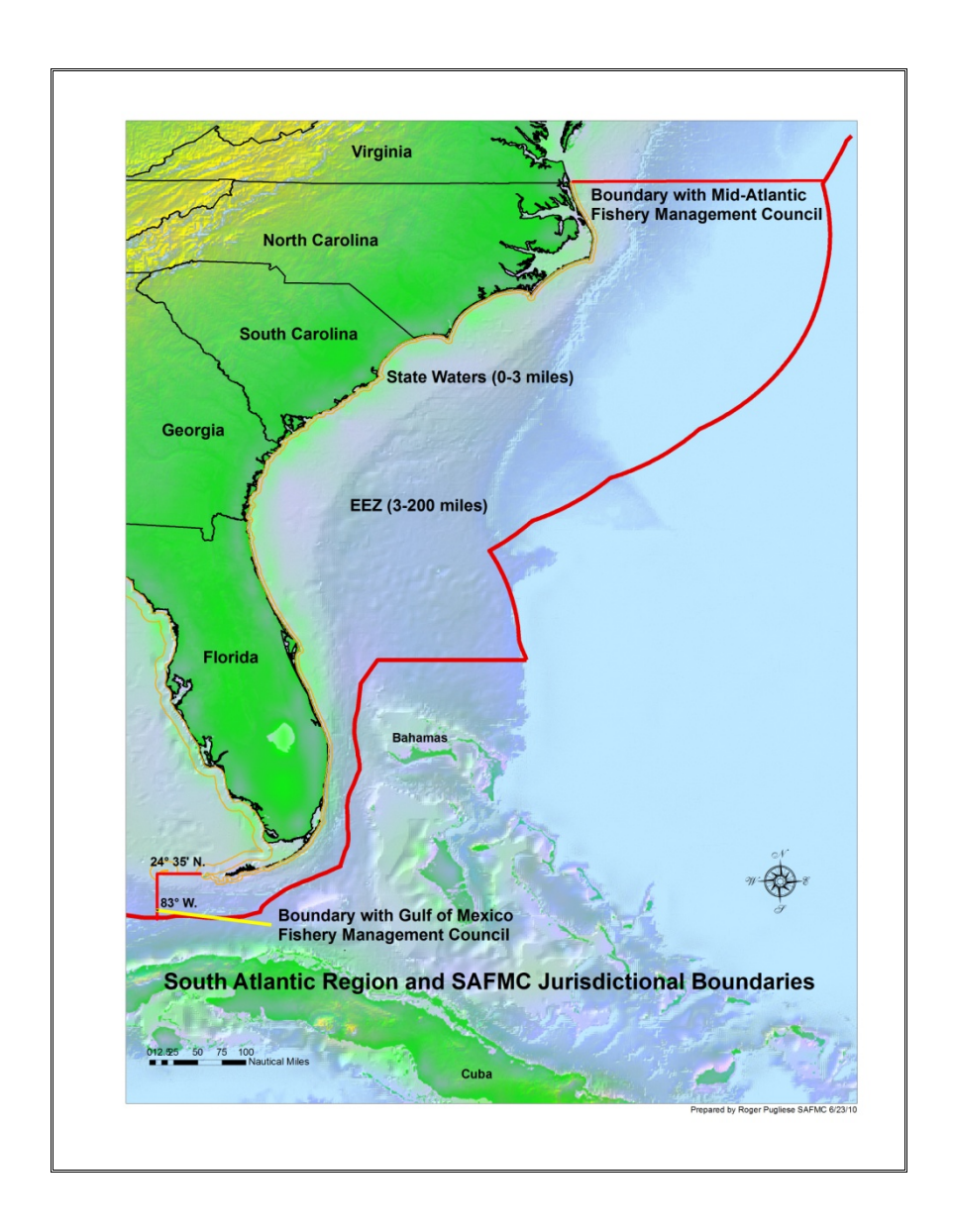
Figure 1. Unless otherwise specified in an EFH designation, SAFMC's EFH designations apply to all waters from the EEZ to the landward most influence of the tide, from the Virginia/North Carolina border to the Dry Tortugas in the Florida Keys.