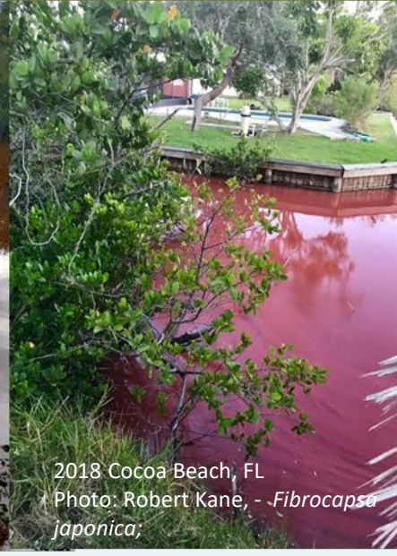
2018 Cocoa Beach, FL Photo: Robert Kane, - Fibrocapsa japonica ;