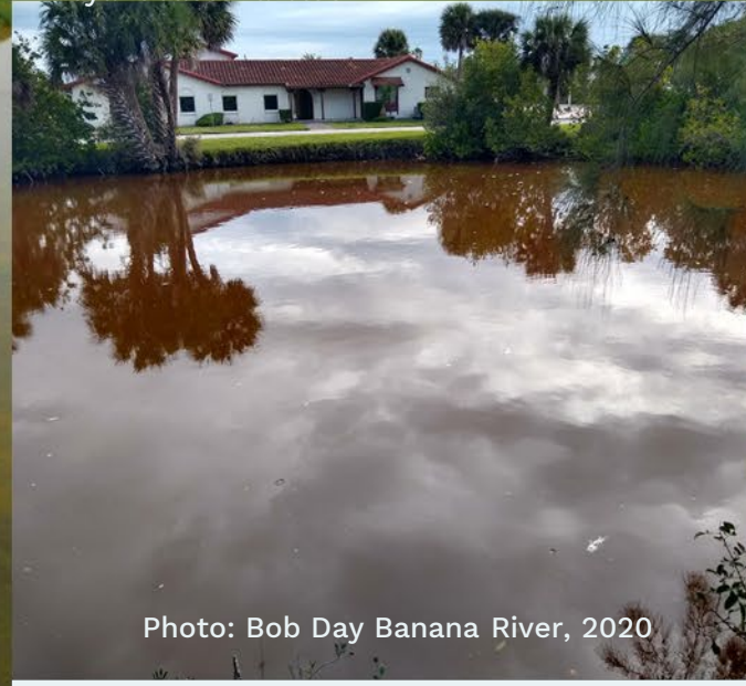
Banana River, 2020