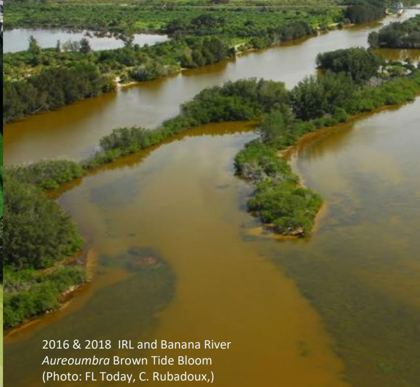
2016 & 2018 IRL and Banana River Aureoumbra Brown Tide Bloom