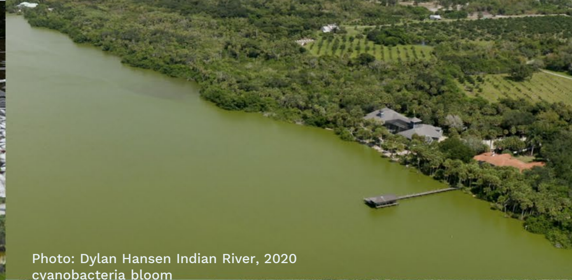
Indian River, 2020 cyanobacteria bloom