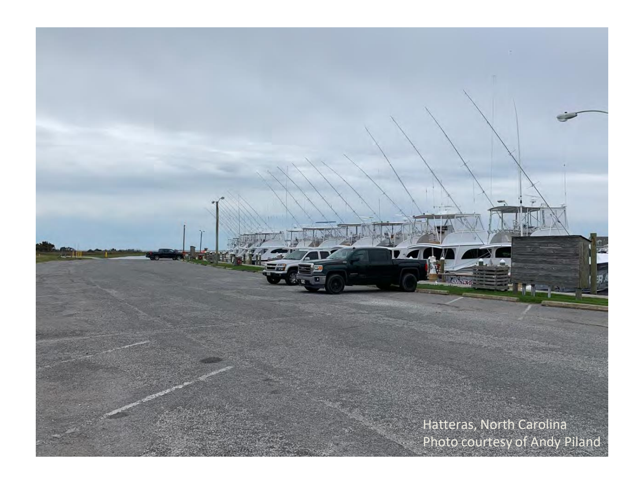
Impacts to For-Hire Industry