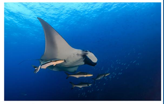
Cobia are well known for traveling alongside large creatures, including manta rays. Anglers looking to target cobia will often look for mantas first.