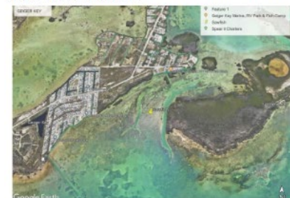
Location and surrounding area where the dead sawfish was found.

On January 31, 2024, the animal was found along a shallow flat ocean side of Deibel Key, near Key West. Officials believe the rostrum was removed between the evening of January 30 to the morning of January 31. NOAA is asking for any information about the person(s) who caused injury to the sawfish and/or removal of the rostrum.