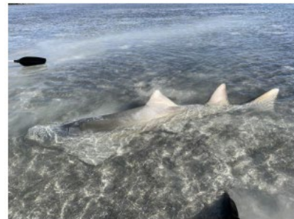
A beached sawfish in shallow water with a cut-off rostrum.

NOAA's Office of Law Enforcement is conducting an investigation involving the death of an endangered smalltooth sawfish near Key West, Florida. Multiple witnesses reported a sawfish that appeared to be unhealthy and struggling to swim, ultimately beaching itself on a sandbar. OLE officers and a U.S. Fish and Wildlife Service Refuge Officer responding to the scene discovered the sawfish missing its rostrum (saw).