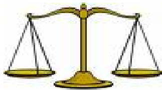
SCALES OF JUSTICE

A NOAA Agent from Charleston, SC issued a $1500 summary settlement to a charter vessel from Charleston, SC for failure to possess a valid Charter/Headboat Snapper-Grouper permit. The charter was boarded by SCDNR approximately 45 miles offshore Charleston with numerous species from the snapper-grouper complex.