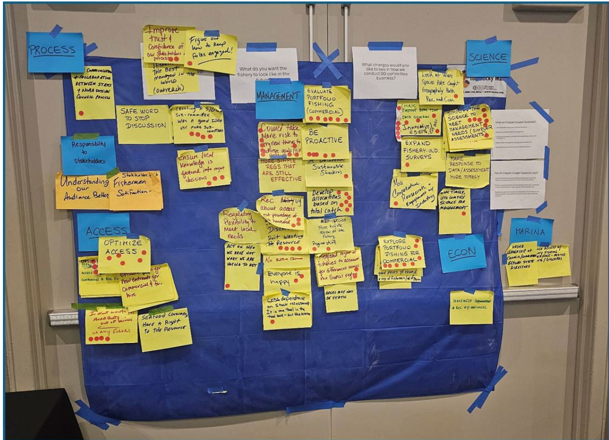
Figure 1. Sticky wall used by the Snapper Grouper Committee to brainstorm "goalposts" for the Snapper Grouper Innovation Plan in September 2025.