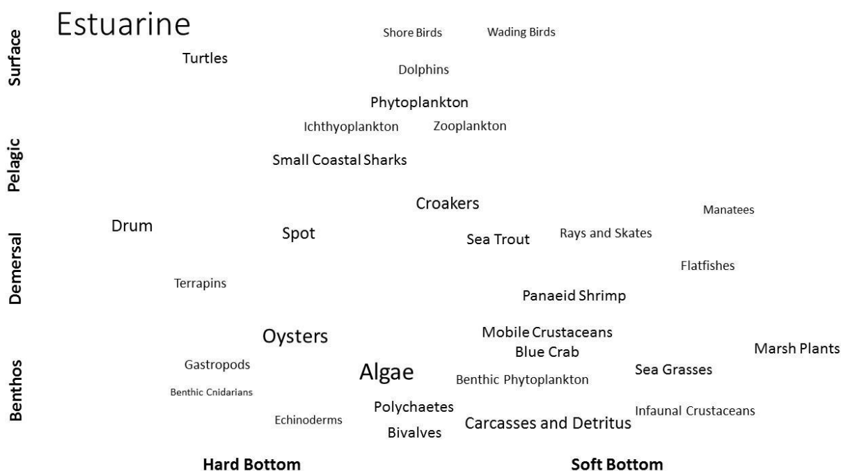
Figure 2-1. Typical components of an estuarine food web.