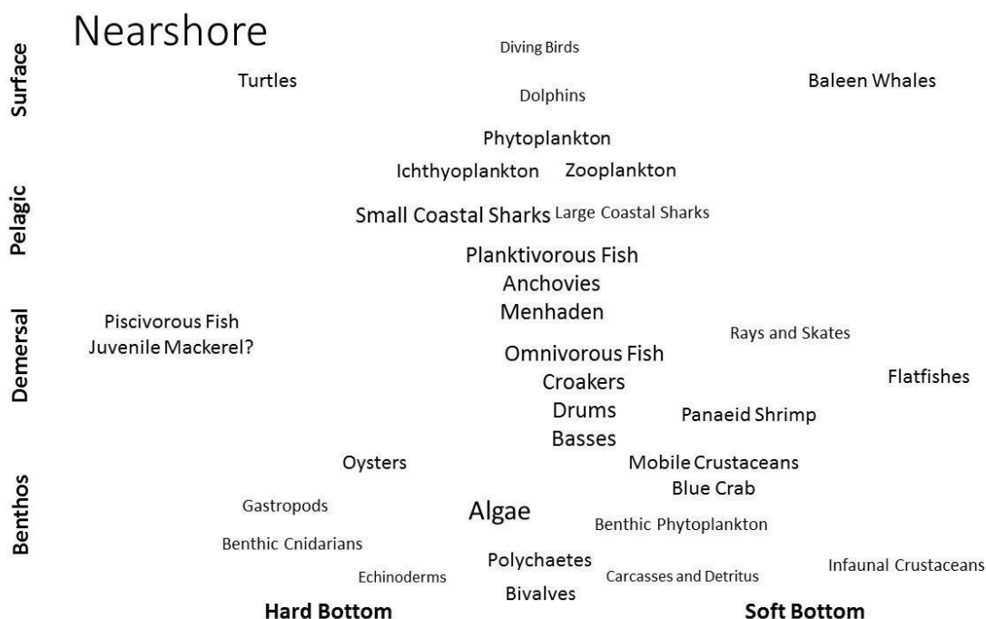
Figure 2-2. Components of a nearshore food web.

invertebrates with pot or trap fishing and hook and line. Sea turtles also commonly use the nearshore areas and consume seagrasses, sponges, cnidarians and other invertebrates.