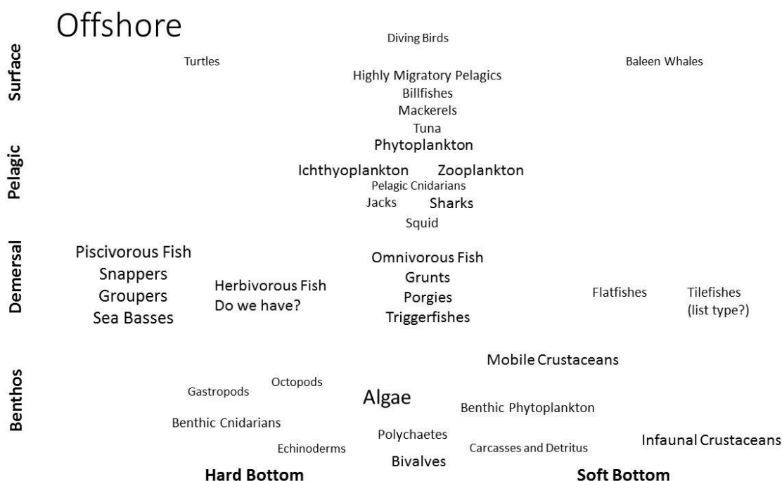
Figure 2-3. Components of the offshore food web

Right whales are seasonal but important components of this food web as well as they rely on mid water zooplankton and can transfer energy along the coast (Lysiak 2009).