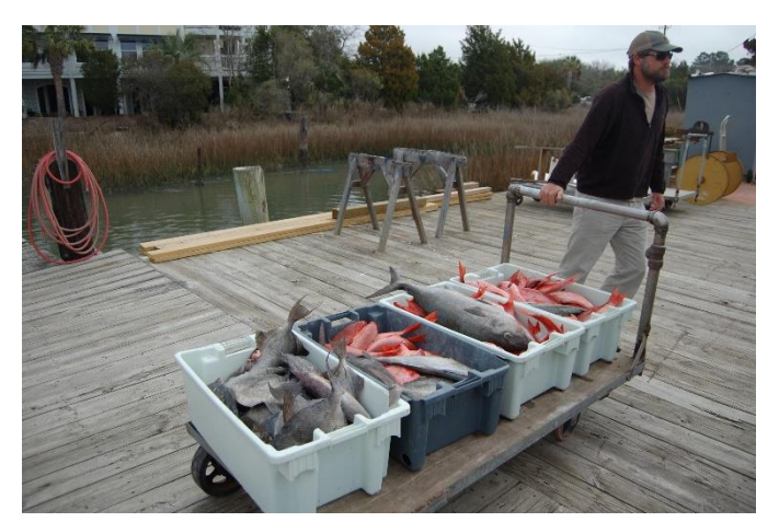
Offloading, Charleston SC