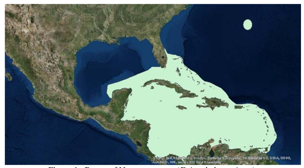
Figure 1. Range of Nassau grouper (Epinephelus striatus).

Nassau grouper occur in Bermuda and Florida, throughout the Bahamas and the Caribbean Sea (Figure 1). Their distribution within Florida is from Cape Canaveral south through the Florida Keys and Florida Bay westward to the Dry Tortugas and Pulley Ridge. They are fairly uncommon in Florida, with mixed accounts of historical abundance, and are considered rare in the Gulf of Mexico. As with most large marine fishes, Nassau grouper demonstrate a bi-partite life cycle with demersal adults and juveniles but pelagic eggs and larvae.