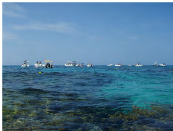
Typical day at Looe Key Existing Management Area