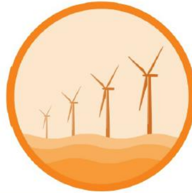
NOAA Fisheries graphics

Many factors, in addition to the ones listed below, could affect fisheries in an era of climate change.