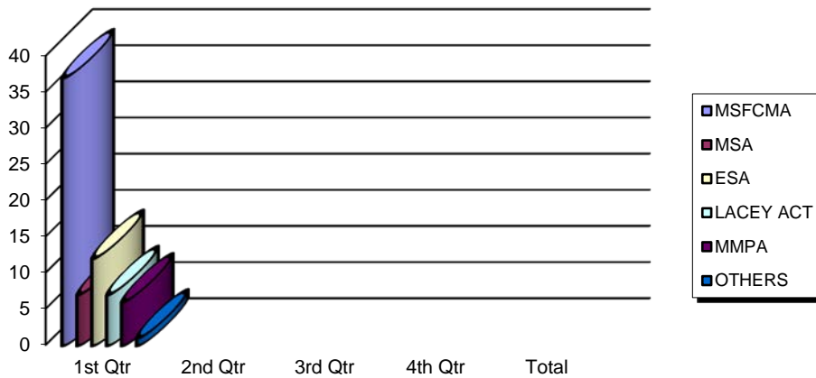
Incidents by Investigation Type FY14